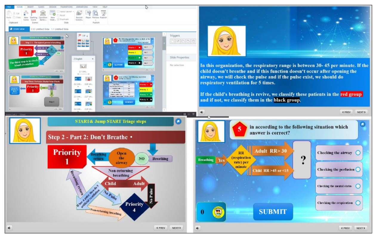
Figure 2: Design of the game environment using Articulate Storyline 3 software. The design of the training sections and the question scenarios are shown in this combined image.